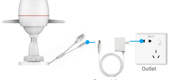
Power Adapter DC12V 1A